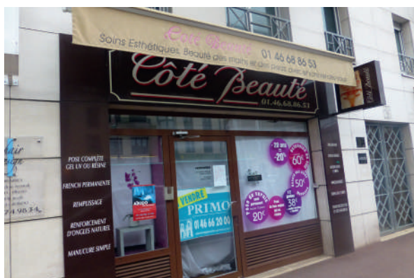
Before the transformation

For more than 50 years, Guinot has gained experience and expertise in beauty salons. Every member in the network applies the brand's tried and tested methods.