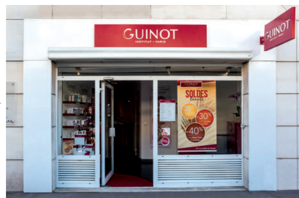
After the transformation