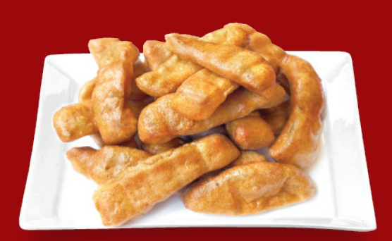
甜不辣 Seafood Tempura