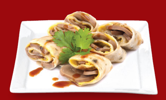
蘑菇起士蛋餅 Mushroom Cheese Egg Crepe