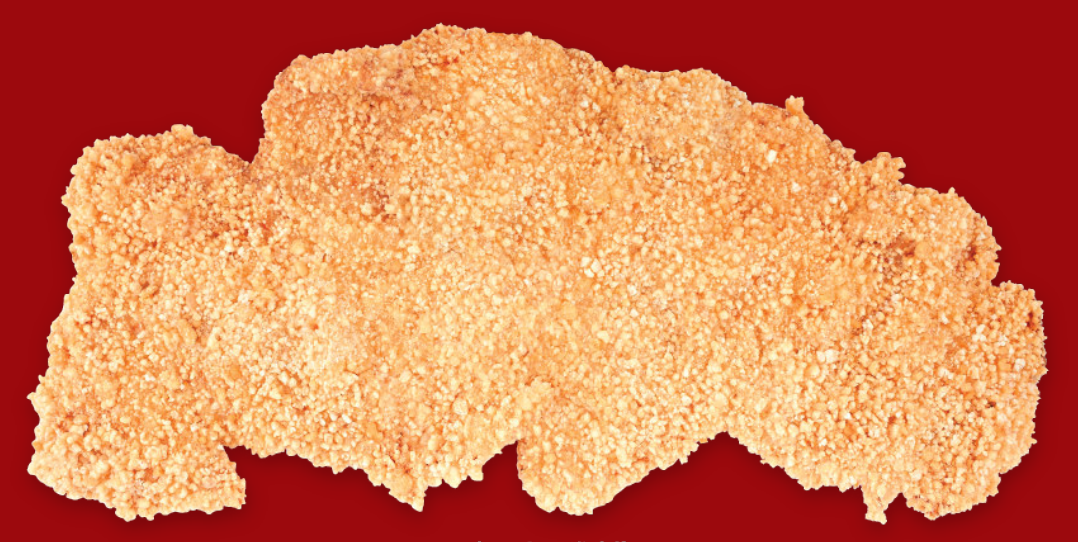
超大雞排 XXL Crispy Chicken