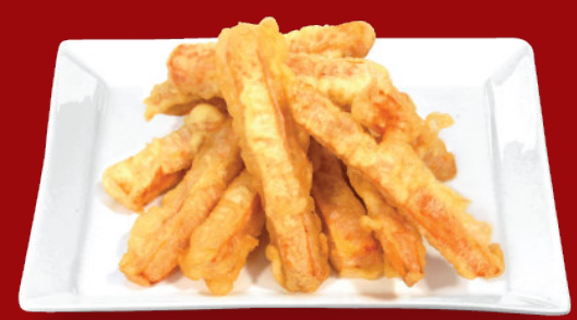
甘梅地瓜 Sweet Plum Potato Fries