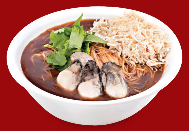
蚵仔麵線 Handmade Oyster Mee Sua